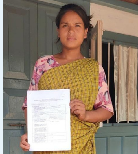
Suchen Dhana village