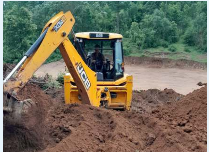
Progress of the construction of community hall at Pdieniadow village

1st phase Community Hall Construction at Kerupara Village, Gambegre Block.