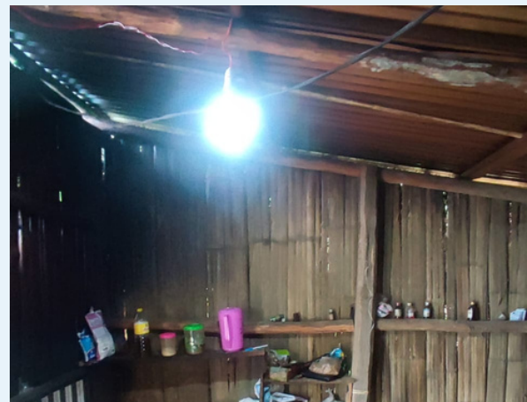
Site verification and electrification at Photdei village, Mawkyrwat block, South West Khasi Hills District.