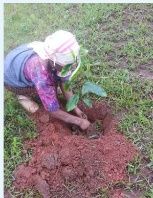
Plantation at Laitdombah Village