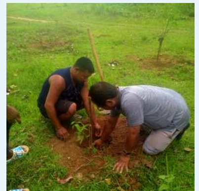
Planting at Ajasiram village