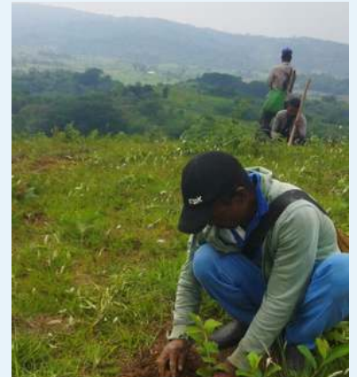
AR model: Plantation at Daistong and Saipung villages