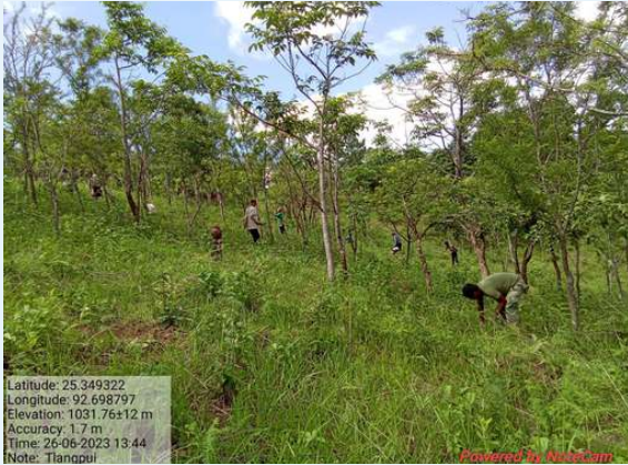
Plantation at Tlangpui village, Saipung Block