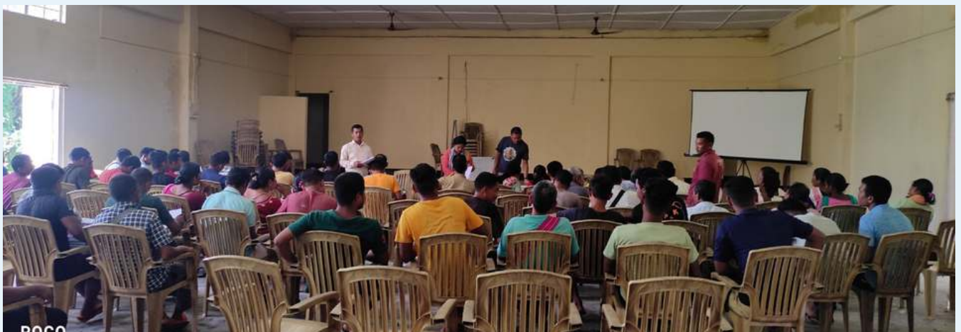
VPIC Meet at Zikzak Block SWGH