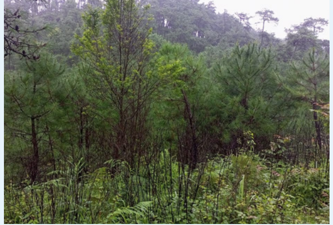
PES verification at Mawnai village