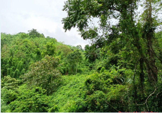
PES verification at Akarok village