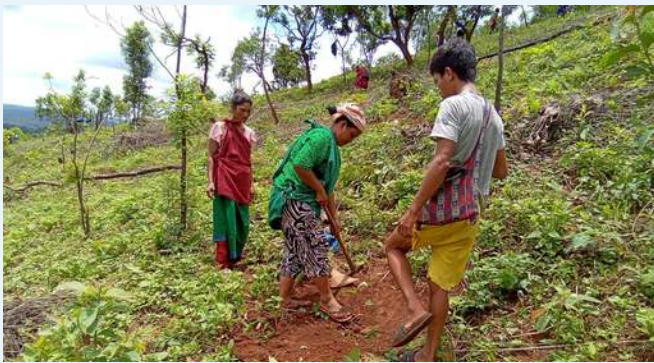
Plantation going on at Sanaro village