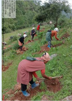
Plantation at kut village, EKH