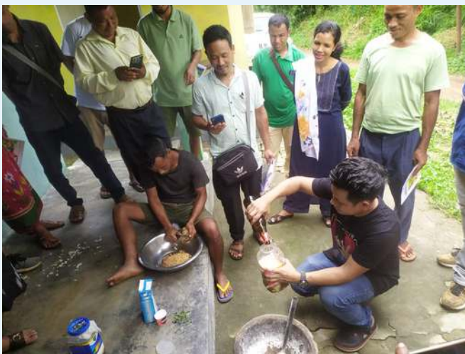
Natural Farming for Dambo-Rongjeng at Songsak Bajar. A total of 24 farmers from Batch 1 villages attended the training.

Organized by CLLMP at Bethany Society, the training programme on Natural Farming includes preparation of Lactic Acid Bacteria (LAB) OHH (Oriental Herbal Nutrients) FAA (Fish Amino Acid), FPJ (Fermented Fruit Juice) IMO (Indigenous Micro Organism) and Oyster Mushroom cultivation, Bokashi Poultry, Bokashi Piggery, Vermi Compost making, Sq feet metre garden etc. The farmers were given both theoretical & practical demonstration.