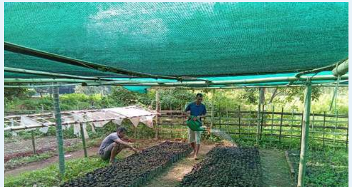
Germination of Terminalia arjuna, Miktongjeng