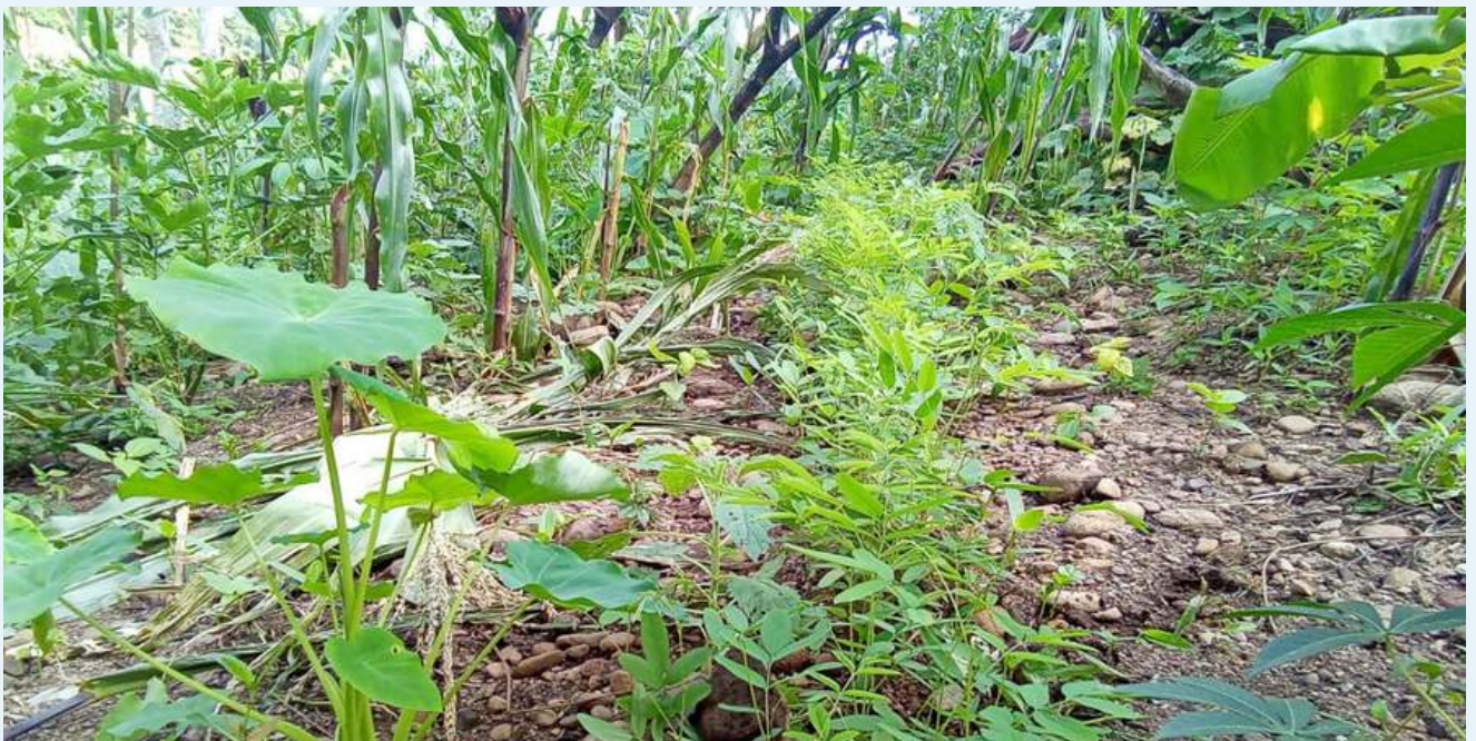
Marsin Ch Sangma's SALT farm, Rongrampara Bajigre village, Dalu block, WGH. One can see that the hedgerow is growing well and the farmer is cultivating seasonal crops like maize and short-term crops like yam