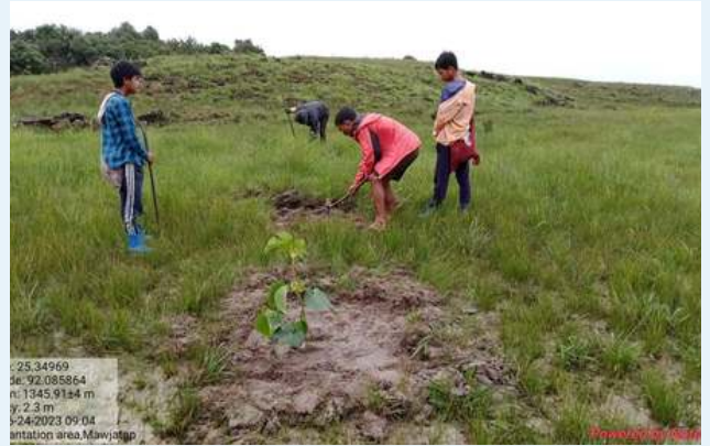
Plantation at Mawjatap village, EKH