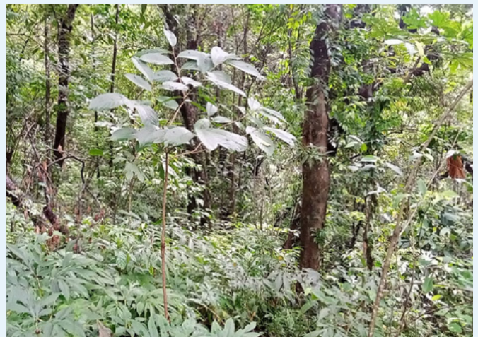
PES verification at Umblai village