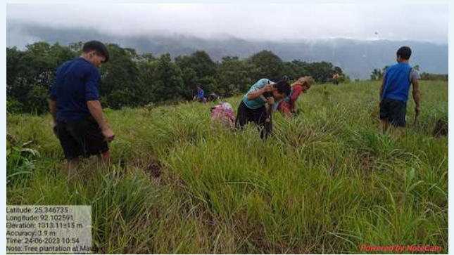
Plantation at Siangkhnai village, EKH