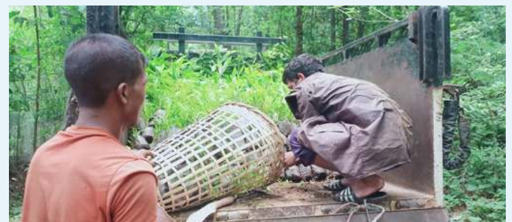
Lifting of tree saplings by Siangkhnai VPIC under Mawkyntse Block.