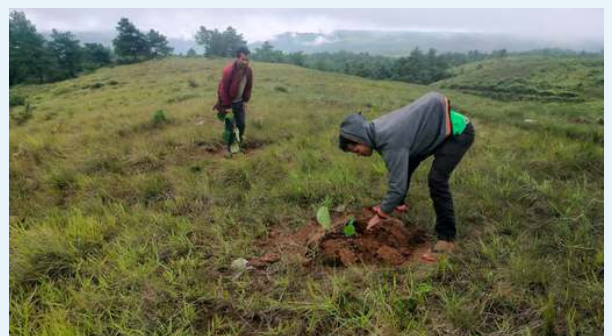
Plantation site at Mawsir village