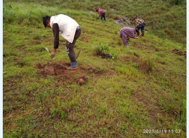
Kremlymbit, Pashang VPIC