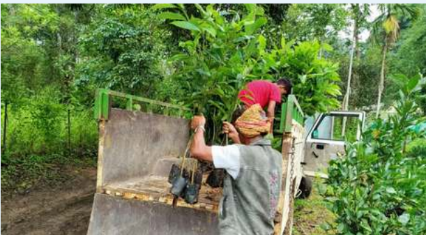
Wahpipa, Umsning Block lifted 3600 saplings from Marngar Nursery