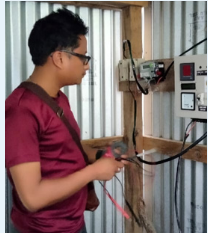
Site Electrification conducted by the Green Energy team at Cham Cham Village, Khliehriat block, East Jaintia Hills for the purpose of Eco-tourism lighting.