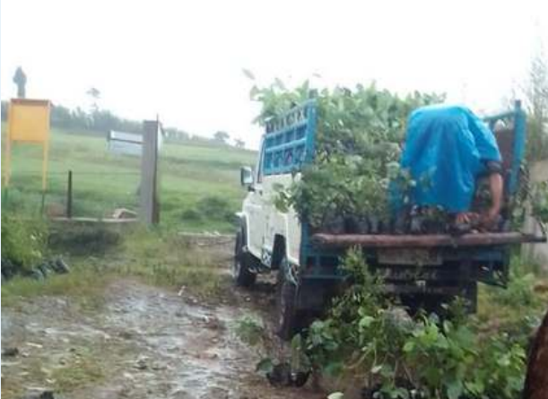
Lifting of 3000 saplings by Mawjatap VPIC

MegLIFE communities are hard at work to achieve the project's goal of covering 22,500 hectares of plantation. Site preparation and advance works are currently underway.