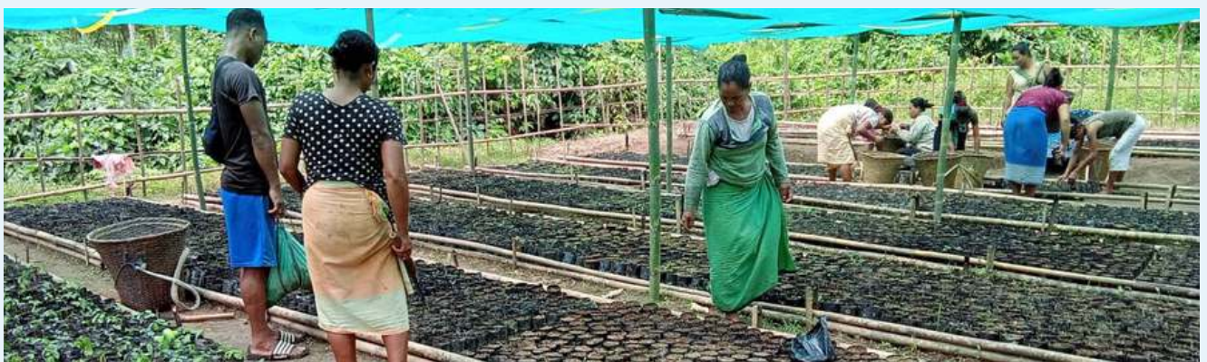
Dokasaram Community Nursery