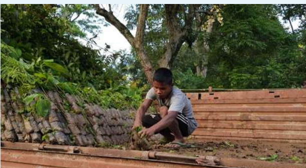
Lifted seedlings from Samgong