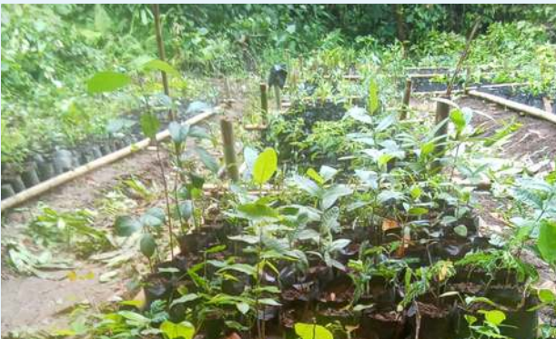
Thapa Dajonggre Community Nursery: Resubelpara Block

The Tebisokgre village successfully completed the restoration of their nursery, which had sustained damage from strong winds.