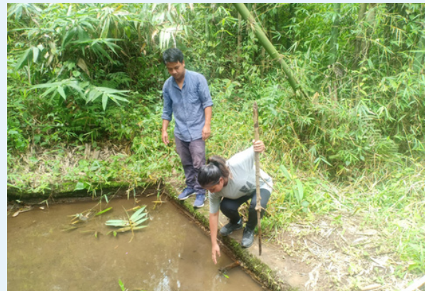
Site supervision for civil works at Ja-ir, Ri bhoi district.