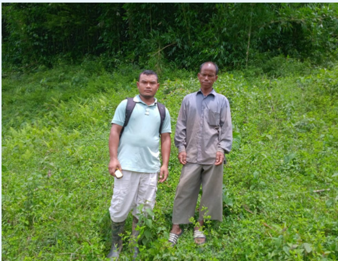
PES verification at Silsekgre Reserve forest