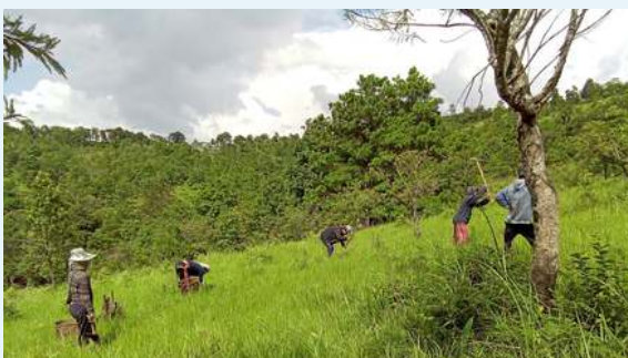
Plantation at Saipung Village, Saipung Block