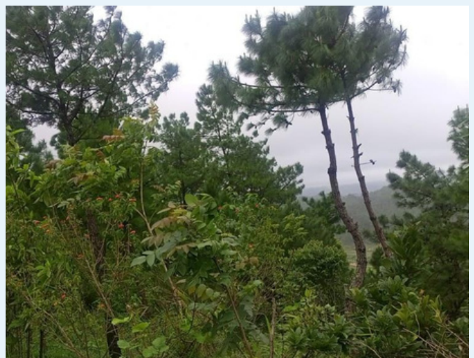
PES verification at Mawtharap village