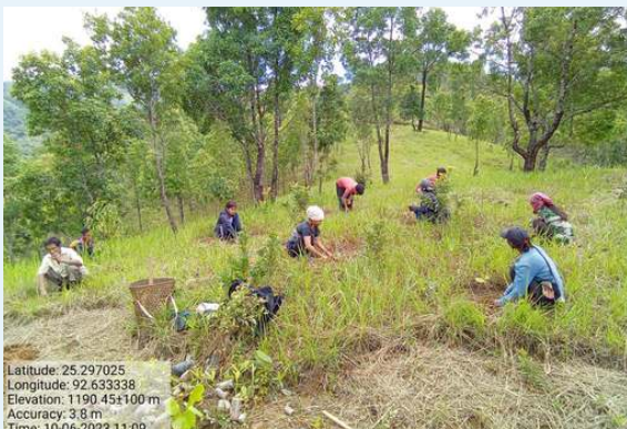
Plantation at Tuidam Village, Saipung Block