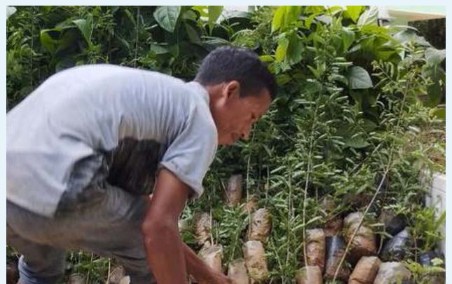
Lifting of saplings from Soil Nursery for Silsekgre, Renchagre and Derikgre