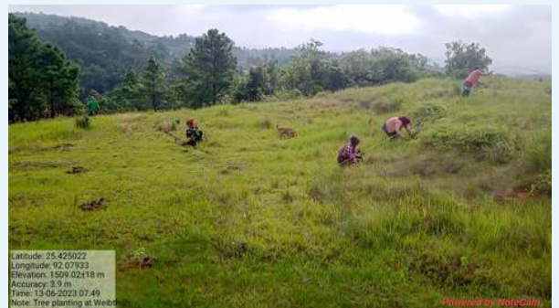
Plantation at Weibthuh, Mawsir Village