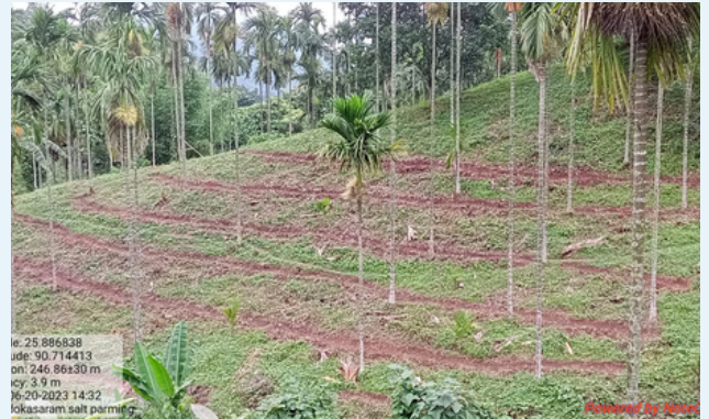
New SALT farm from Dokasaram village: Resubelpara Block