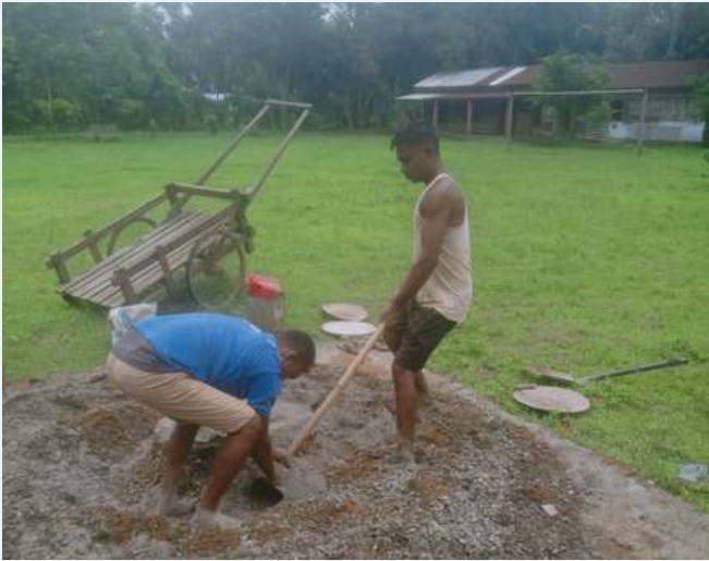
Rongpetchi Community Hall

The construction of 370 community halls has been sanctioned under EPA of MegLIFE. Initial phases of site preparation is underway.