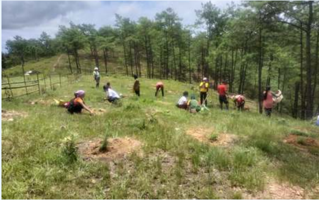
Plantation at Pomlahier village, EKH.