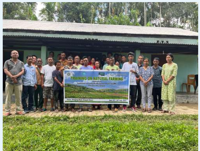
Natural Farming completed at Songsak Bajar for Dambo-Rongjeng. The farmers show interest in different techniques of Natural farming.